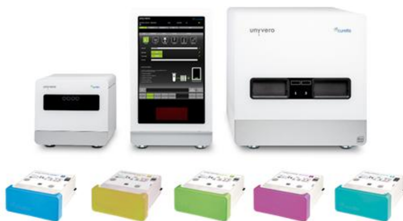
Figure 1: Unyvero A50 Platform

The Unyvero A50 System consists of three devices, the Unyvero L4 Lysator, the Unyvero C8 Cockpit and the Unyvero A50 Analyzer. The Unyvero L4 Lysator is used for sample pre-processing and pathogen lysis. The Unyvero C8 Cockpit is the control panel for the Unyvero L4 Lysator and Unyvero A50 Analyzer and displays the results of patient sample analysis. The Unyvero A50 Analyzer integrates mechanical, electronic, pneumatic and optical elements and enables a fully automatic random-access processing of the Application Cartridges. The Application Cartridges are single-use, disposable and disease specific. The Unyvero System, together with proprietary software and the Application Cartridges, comprise the Unyvero A50 Platform.