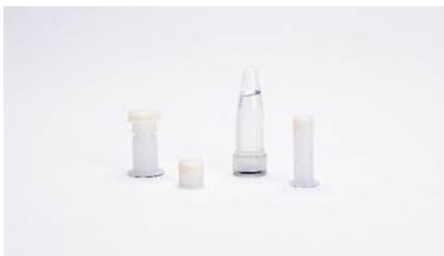
Figure 2: Unyvero sample tube, sample tube cap, sample pre-treatment tool and Master Mix tube

The Unyvero A50 Analyzer instrument consists of mechanical, electronic, pneumatic and optical elements and enables a fully-automatic random-access processing of the Application Cartridges. Once a run is started, the Unyvero A50 Analyzer automatically executes and controls all sample processing and analysis steps (including DNA extraction, DNA purification, PCR set-up, highly multiplexed end-point PCR amplification and a hybridization array-based fluorescence detection) inside the Application Cartridge. For safety and equipment longevity, and to avoid issues of calibration or waste-removal, the Unyvero A50 Analyzer contains neither reagents nor waste. All fluids are handled within the sealed Application Cartridge. Up to four Unyvero A50 Analyzers can be attached to a single Unyvero C8 Cockpit and each Unyvero A50 Analyzer includes the two available slots that provide full random access per Unyvero A50 Analyzer, allowing the processing of up to eight patient samples simultaneously within four to five hours. In the future, OpGen believes a further expansion to up to eight Unyvero A50 Analyzers will also be possible.